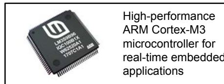
High-performance ARM Cortex-M3 microcontroller for real-time embedded applications